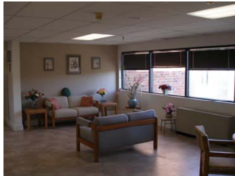
Fifth Floor Lobby Area

Ratekin Tower offers many facilities. These include a laundry room, TV area, library, social areas, dining room, kitchen area, fenced outdoor recreation area and indoor mail delivery. There are 11 wheelchair accessible apartments.